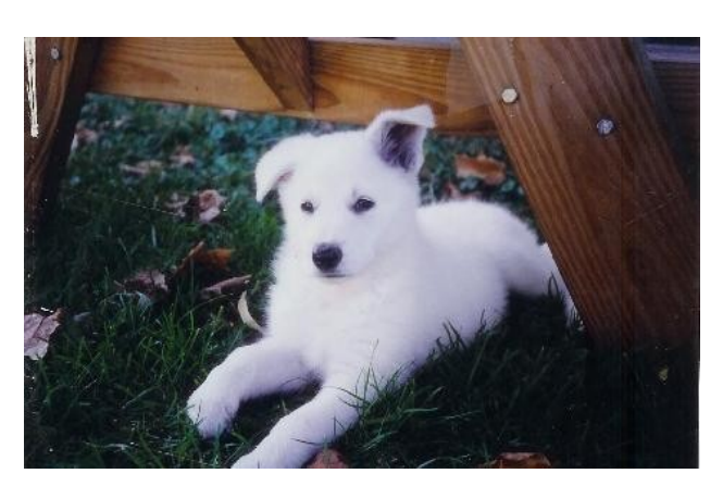
Bridget as a puppy