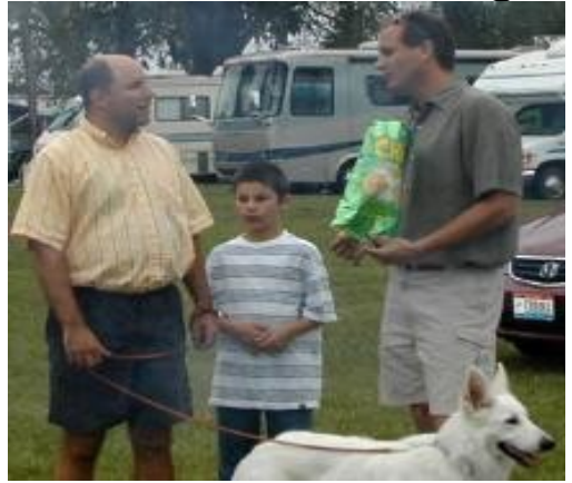
After dinner and the meeting, there was plenty of time to socialize.