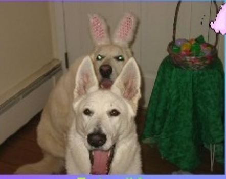
Entry #4 Halo Submitted by: Davey Fobin