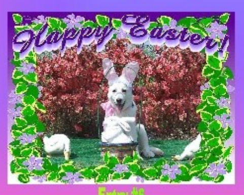
Riza Submitted by: Foxhant White Unspheres