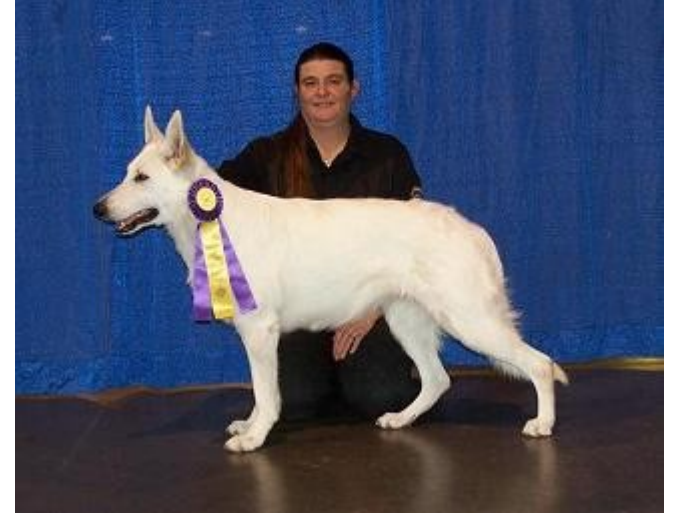
New Grand Champion! GRCH Vschrader Blue Sky Ahead of FS Owned by: Scarlett & Tim Sanders Breeder: Brenda Schrader