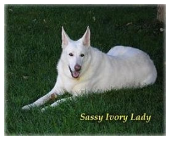
Happy 11th Birthday to Sassy! Feb. 6, 1996