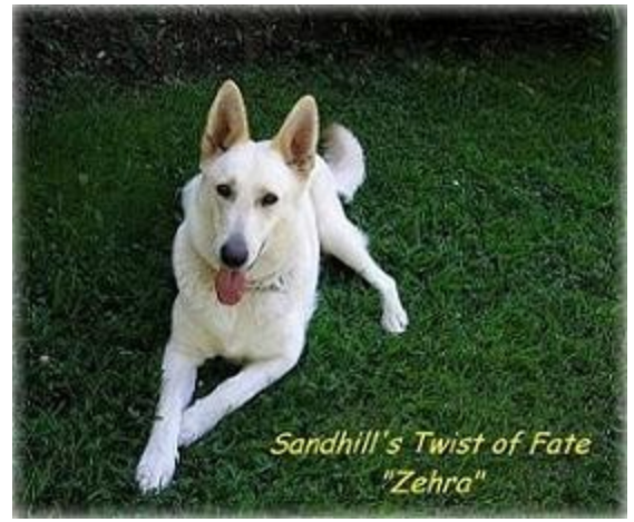
Happy 5th Birthday to Zehra ! Feb. 24, 2002