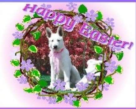
Entry #7 Riza Submitted by: Foxhunt White Shephends