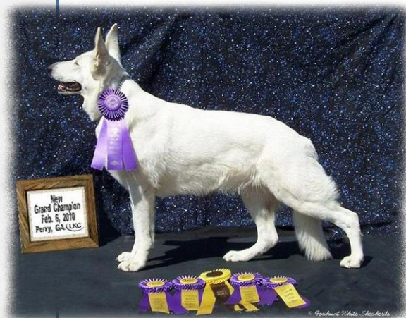
New GRCH - BPIMBS, BPIS, GRCH Foxhunts It's All About Me, CGC - "Mia"