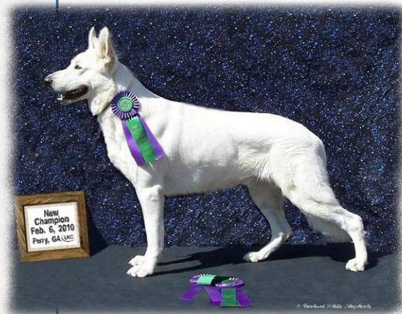
New CH - CH Steel's Royal Combo Of Foxhunt "Bo"