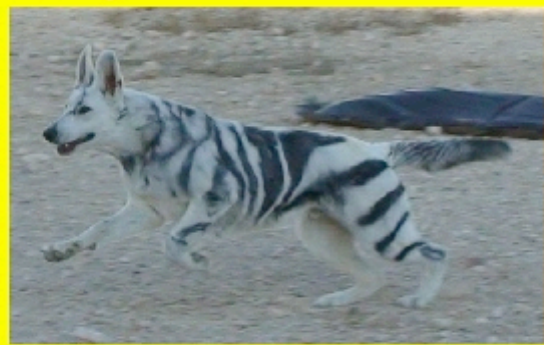
Submitted by Nicole Harmer