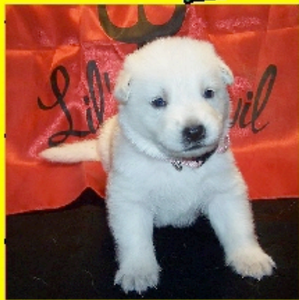
Submitted by Scarlett Sanders