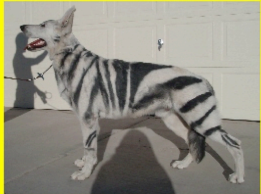
Submitted by Nicole Harmer