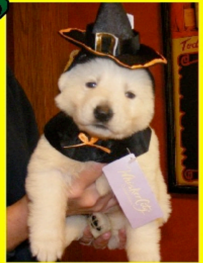
Submitted by Mona Perrson