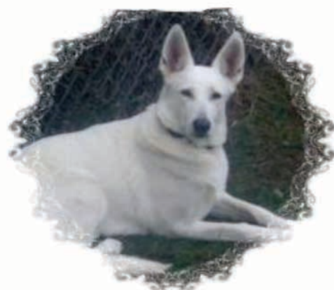
Happy 4th to Beauty on 2/15/09! Owned by Kim King