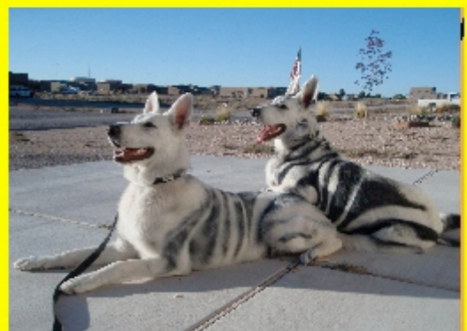
Submitted by Nicole Harmer