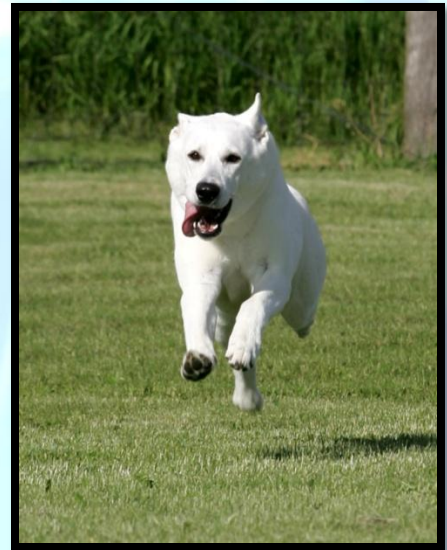
Entry #19: Arleen Ravanelli

Thank you to everyone who participated in our summer photo contest! All the entries were wonderful and sure captured the essence of summer!!