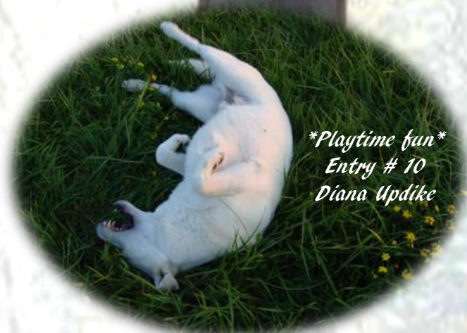
*Playtime fun* Entry # 10 Diana Updike