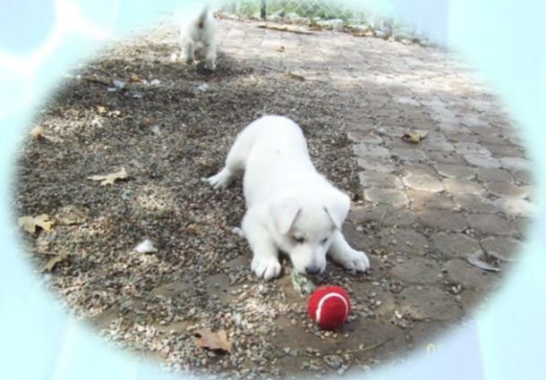
Entry # 13: Arleen Ravanelli