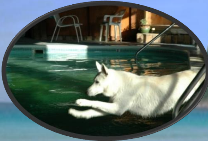
*Water fun* Entry #2 Betty Tanner and Pirate

A special thank you to our judge, Courtney King! Courtney emailed and said they were all wonderful pictures and just could not pass up the adorable puppy picture!