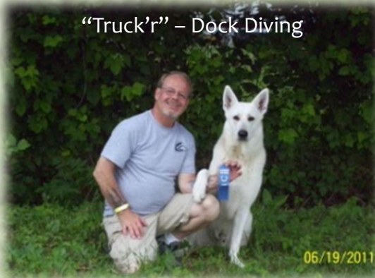
"Truck'r" - Dock Diving