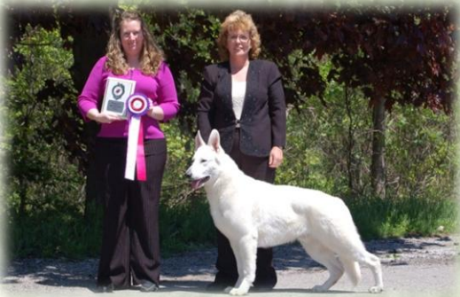
Royal Born to be Wild (Phalen)