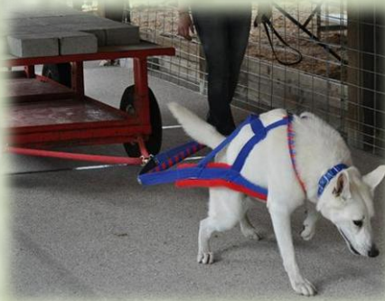
Royal Ready Set Go (Raider) Weight Pull and Rally-O Titles