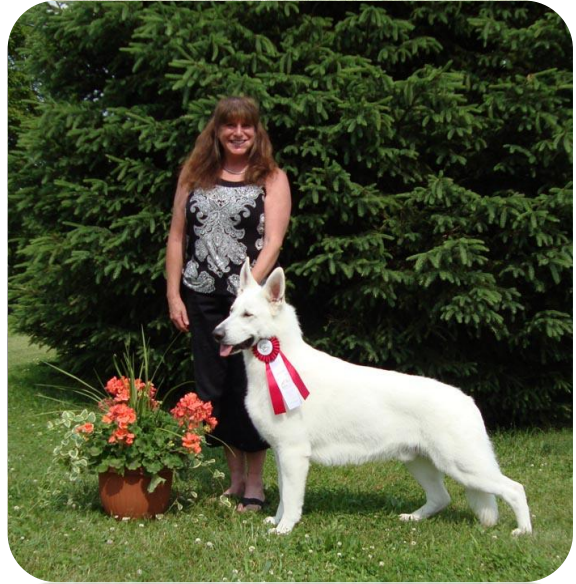
Ramsey - Premier Sunday Show - Herding Group 2nd