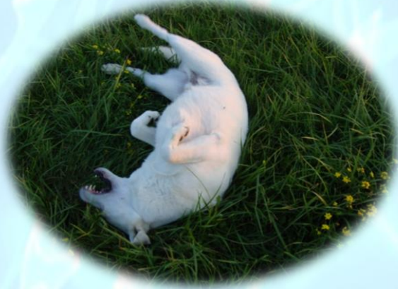
Entry #10: Diana Updike