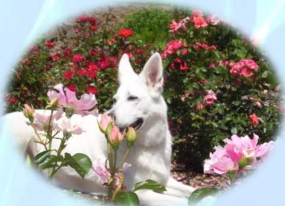
Entry # 14: Arleen Ravanelli