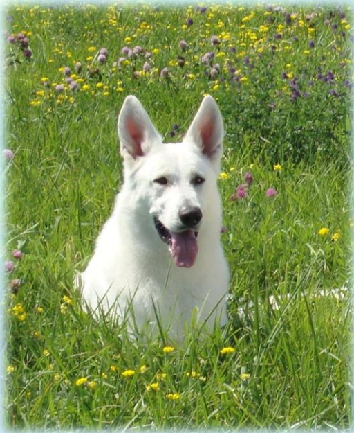
Entry #12: Diana Updike