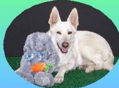
Diamond - 1 3/4 years old Owner: Scarlett Sanders Breeder: Angie Winters