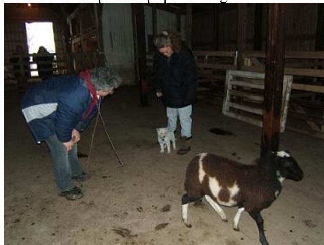
Testing the pups reaction to the sheep