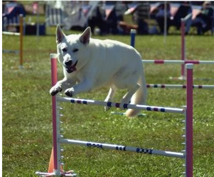
Apollo takes a jump at an Agility Trial

chute when I fabricated one out of a rubber barrel and my old shower curtain that had the right odors on it. After training with this chute, Apollo learned to handle any chute he encountered. The teeter was just a matter of realizing Apollo felt more comfortable with me on his right side. So Apollo trained me to set up his entrance onto the teeter with my left hand guiding him. Now, he has let me know that he is okay coming onto the teeter on either side. We were, it seems, starting to teach each other, and I was finally beginning to listen to Apollo.