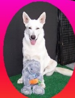
Easy - 1 1/2 years old Owner: Scarlett Sanders Breeder: Proud Haus Shepherds