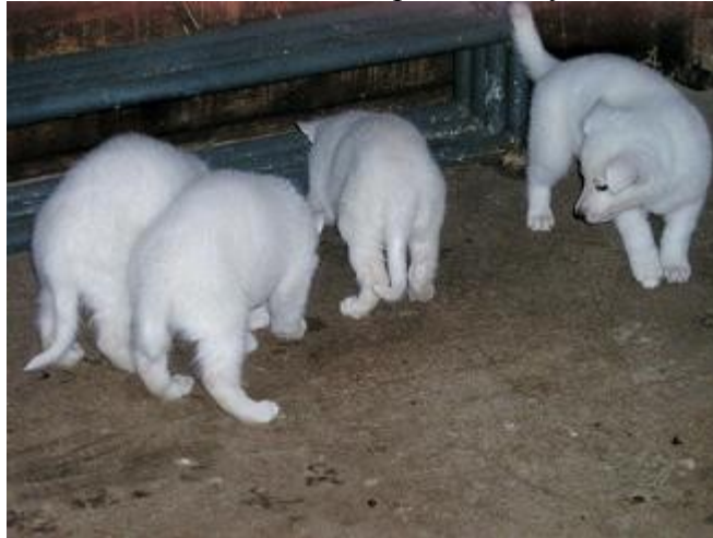
The litter as a whole has good herding instincts

The litter as a whole was determined to be very confident, and it was obvious that the pups had lots of hands-on attention and were well-socialized. To top it off, they also have herding instinct!