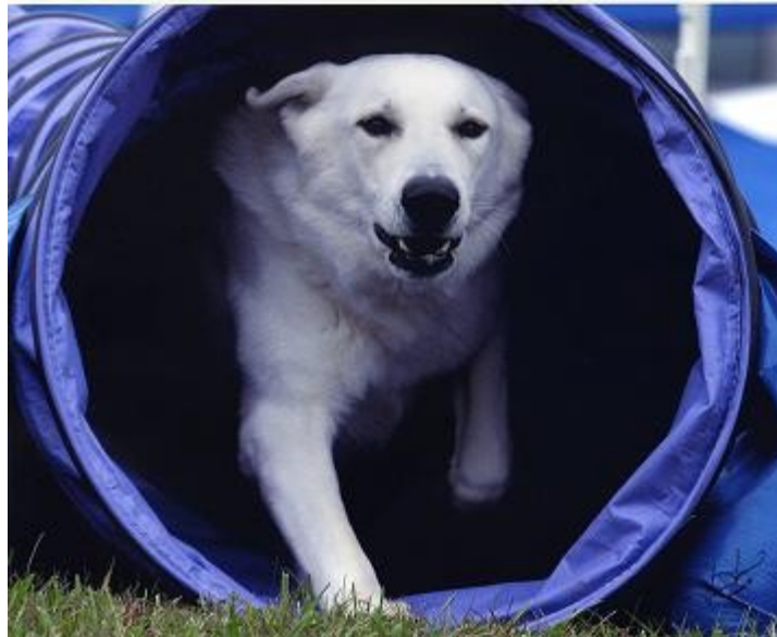
Apollo in Tunnel

From my perspective, Agility creates and requires a level of partnership, between handler and dog, not readily seen in other events. Following a training session in Obedience at our local dog-training club, I watched an advanced Agility class and was immediately struck by the intense focus the dogs had on their handlers, both on and off the Agility area. The level of interplay between dog and handler I observed that day attracted me to agility, as the level of partnership required both inspired and challenged me. I enrolled us in the next starting class to begin a journey that was, and is, fun, frustrating, enjoyable, aggravating, and rewarding.