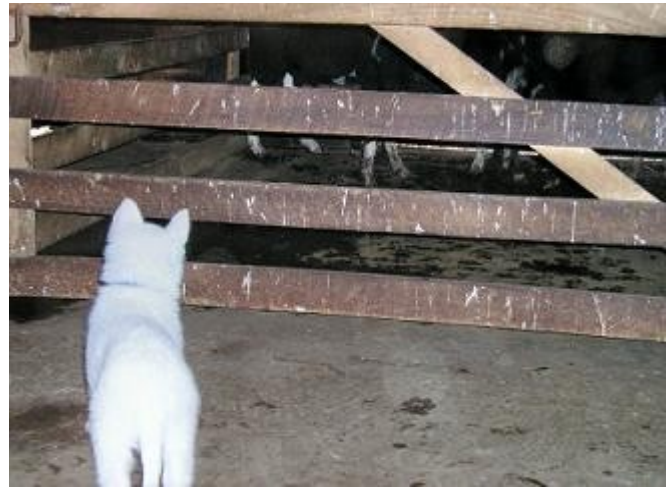
Pups getting acquainted with the sheep