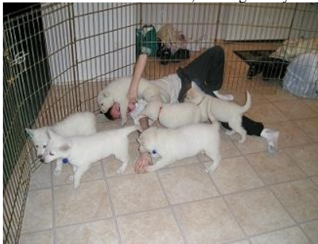
Haley X Hugo litter born on 12-03-05

The puppies were born on December 3, 2005; 7 boys and 2 girls. To help identify the qualities of each puppy, I planned on performing Conformation Evaluations, Puppy Aptitude Tests (for temperament) and Working Dog Evaluations (to evaluate good working temperaments) on the puppies. There was another component that needed to be covered; herding ability.