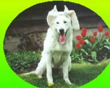
Dinah - 12 months old Owner: Jackie Wheeler Breeder: Reeves Royal Acres