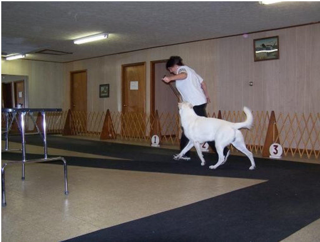
Scarlett exhibiting Easy at an AKC sanctioned match

I take every chance I can get to bring out and educate folks on the White Shepherd!! I don't let anyone ever intimidate me when it comes to our wonderful breed!!