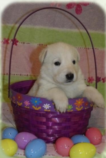
Entry #5 Mona Perrson