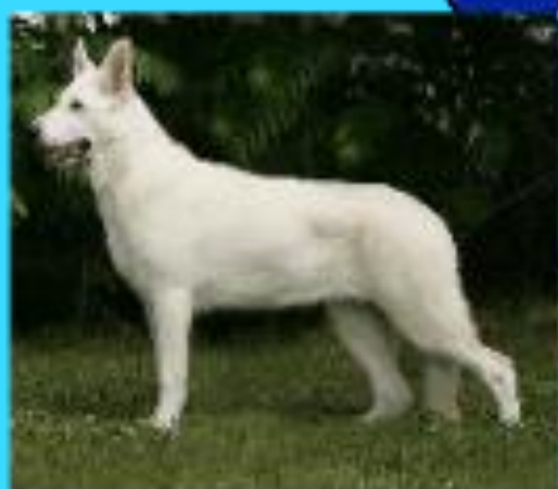
CH, Shylo's Star Keely Belle, CGC, STAR, VCC, VCCX, HIC (d,s)

Our Performance Litter is due first part of April !!! Check out our website for more details.