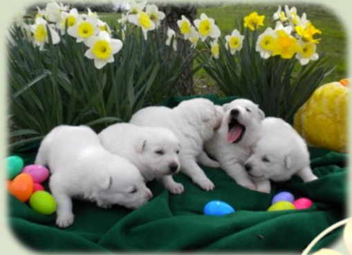
Entry #2 Melanie Fuellgraf