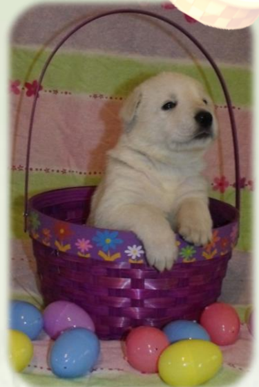
Entry #4 Mona Perrson