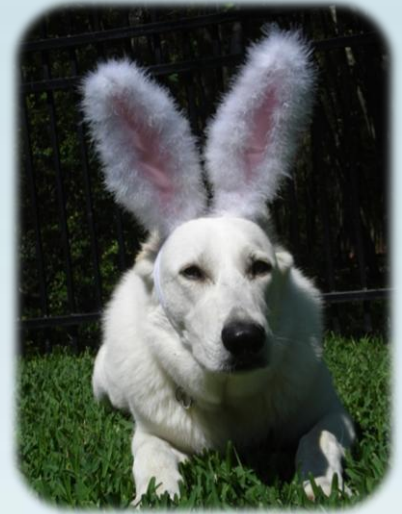
Entry #18 Tara Tippit