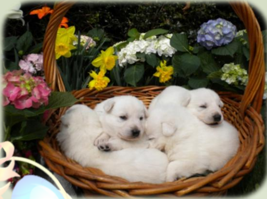
Entry #1 Melanie Fuellgraf