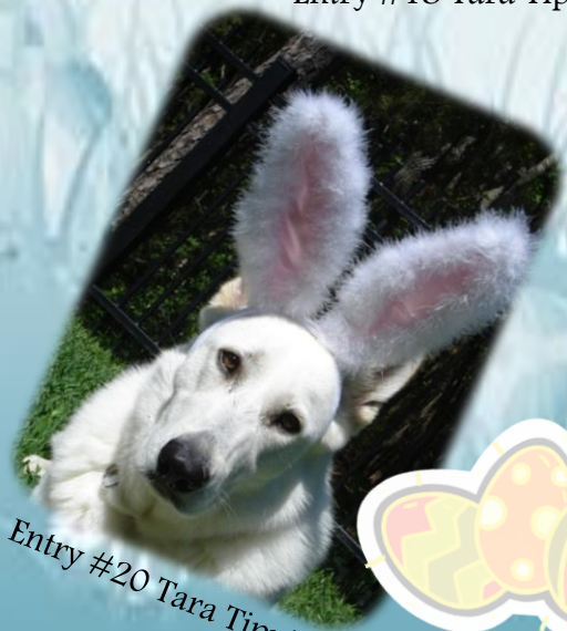
Entry #20 Tara Tippit