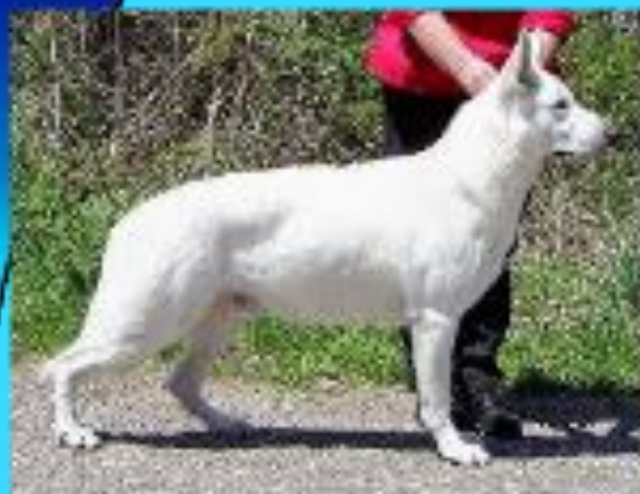
GRCH, CA, UTWP, Royal Ready Set Go, CGC, VCC, VCCX, HIC (s)