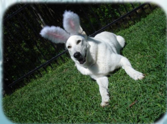
Entry #19 Tara Tippit