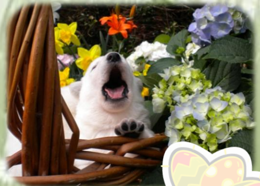
Entry #6 Melanie Fuellgraf