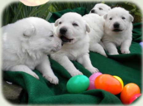
Entry #3 Melanie Fuellgraf