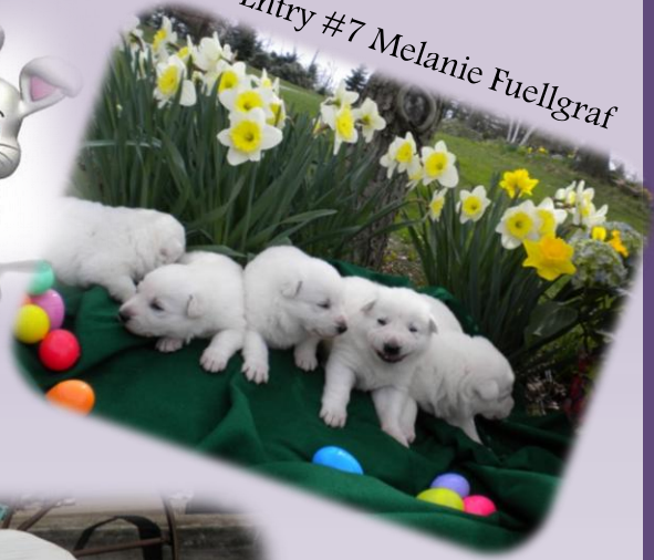
Entry #7 Melanie Fuellgraf