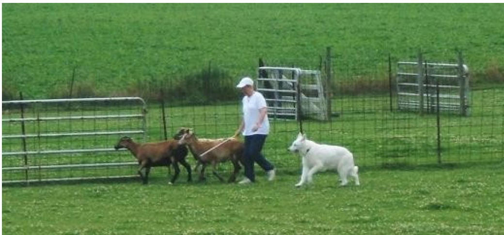
Luna and Becky - boundary work

The judge must observe the handler and the dog but may not physically assist the handler or the dog in controlling the livestock. The judge may advise the handler on how best to encourage the dog to move the stock and how to maneuver around the course. The dogs should be permitted to work the stock as much as possible with a minimum of commands by the handler.