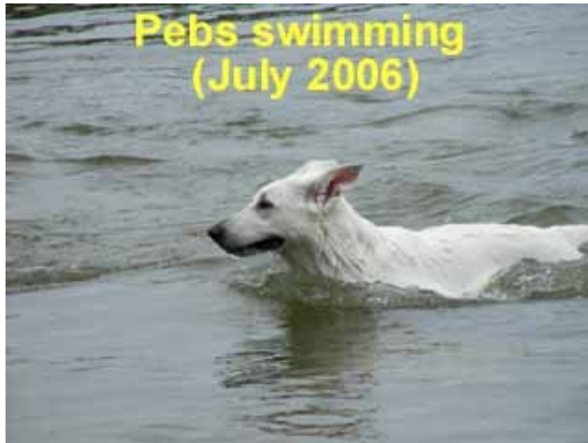
Pebbles is very athletic

point major from the 6-9 month old puppy class. The next day, she earned her first leg towards her AHBA Herding Capability Test (with sheep).