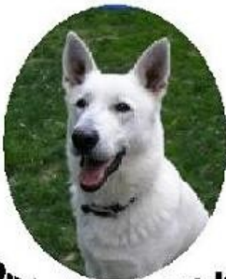
Ruger's 3rd Birthday Hidden Hill White Shepherds June 28, 2003