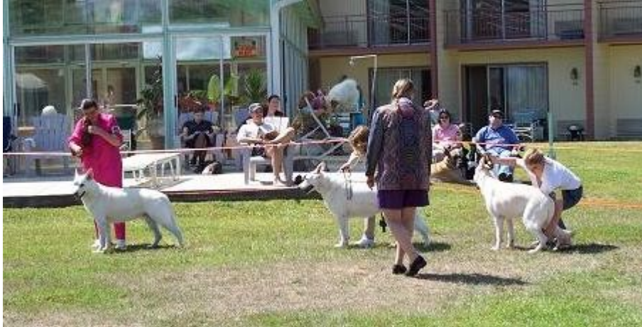
Best of Breed Class at Perry, GA.