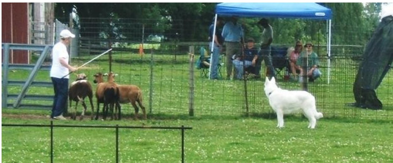
Luna and Becky - controlled stop

Once everyone has run the course awards are given along with your score sheet. The score sheet tells you if you passed or failed and what kind of stock you were tested on. There are also seven categories they check Yes or No if you dog demonstrated them or not. Those categories are stay (a controlled pause) at beginning, controlled passage of stock, stock cleared four gates, change of direction, one stop on course, stop while handler opens gate and re-pen. Even though Luna finds boundary work boring (she'd rather work the sheep) Luna passed everything. Her course time for our first run was 4:35 and our second run was 3 minutes.