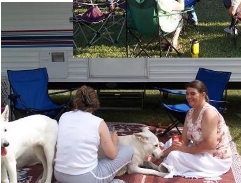
Everyone had a wonderful time socializing!