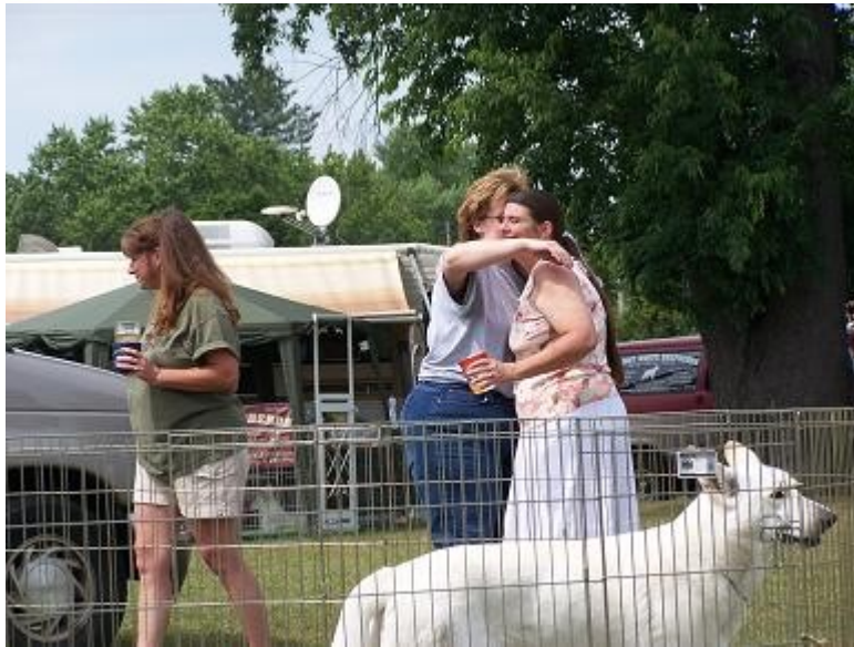
Friends old and new had a great time visiting