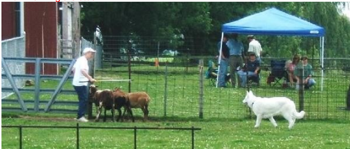
Luna and Becky re penning sheep