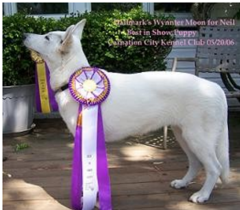
Best in Show - Puppy Match Hallmark's wynnter Moon for Neil