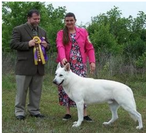
GRCH/ BOB/Group 3 - GRCH Proud's Winslow N' Easy of FS