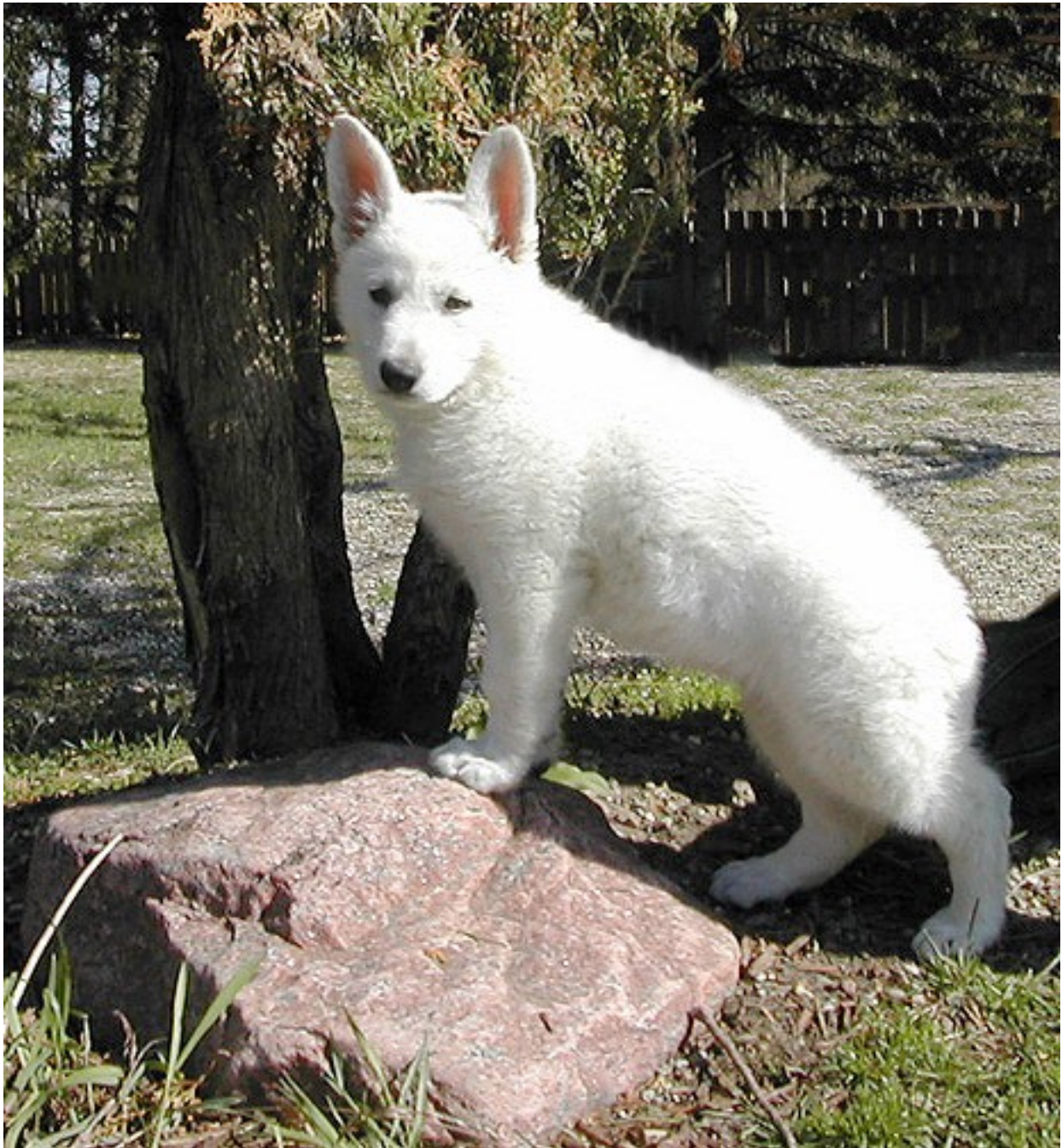
UKC GRCH/AWAS CH Royal Spasz Von Tasz, HC, CGC, PennHip, OFA prelim elbows

with us and her favorite spot is at the very front of the boat, looking out over the bow. She also loves to chase the squirrels in her back yard.