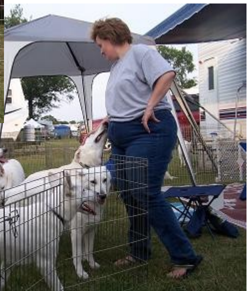
It's all for the White Dogs!!!