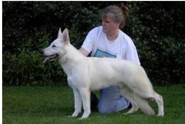
New Champion - Starr Hallmark Hemi Supercharger