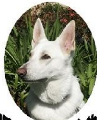
Diamond's 2nd Birthday Foxhunt White Shepherds June 20, 2004