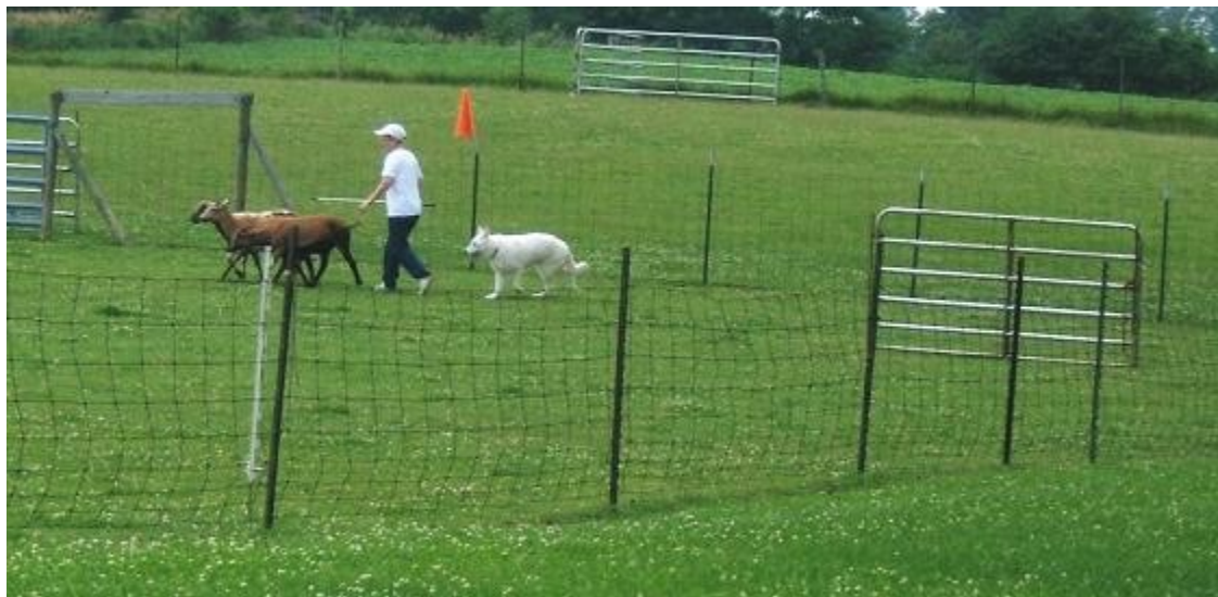
Luna & Becky - Narrow end of the arena

down/stay until the commanded to pen the stock. Four gate passes are required and at some point on the course the handler must demonstrate that the dog can hold a stop (controlled pause). The test is completed when the gate is closed and the handler may leash the dog.