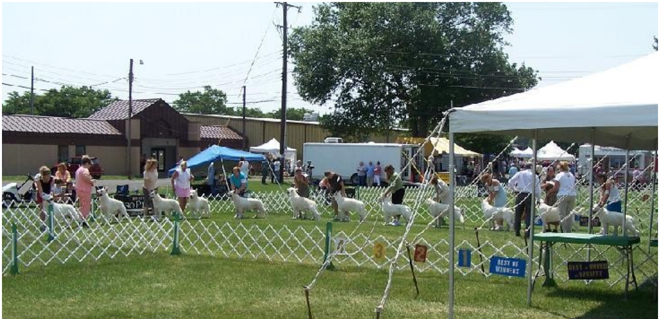
UKC Premier 2006 Grand Champion Class on Saturday June 17th.

The 2006 UKC Premier has come and gone, leaving us with many fond memories of good times with friends, old and new and so many beautiful white dogs! There were White Shepherds showing and several more there that weren't showing. As expected the white dogs made a good impression on both the spectator's and the judge's, they received several really nice compliments. The judges also complemented the White Shepherd owners and supporter's in attendance for their high spirited and genuine support of one another.