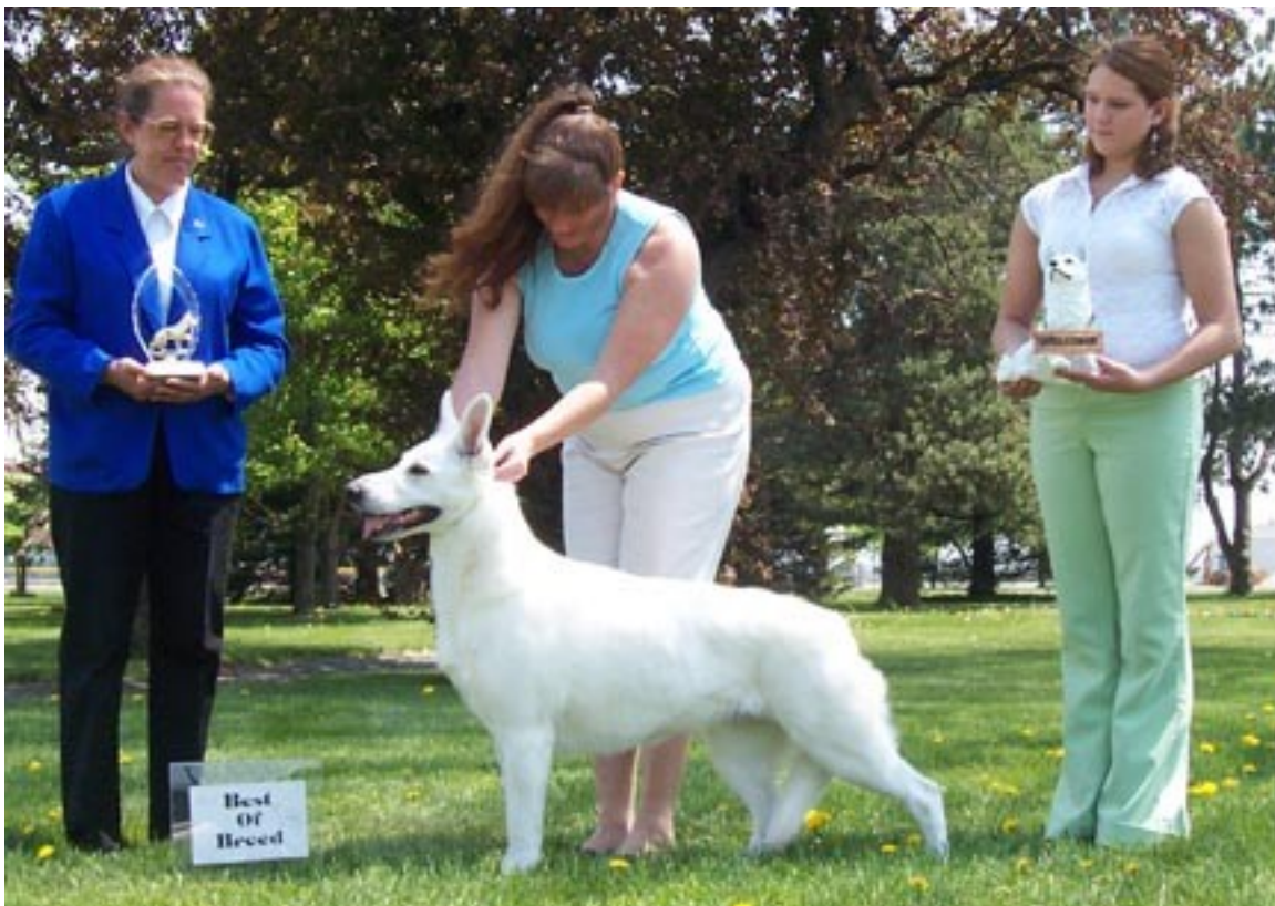
Pebbles Best of Breed - May 2005

Pebbles show career kicked off the day after I lost my beloved old girl, Sassy (Pebbles' Great-Great Grand Dam). Only a few select people knew about her passing but I can't tell you how healing it was for me to be at the annual Indiana dog shows, surrounded by my extended "dog family", seeing many of them for the very first time after a long winter, talking dogs, and showing my new little girl. Notably, Pebbles took "Best Puppy" the very first show!