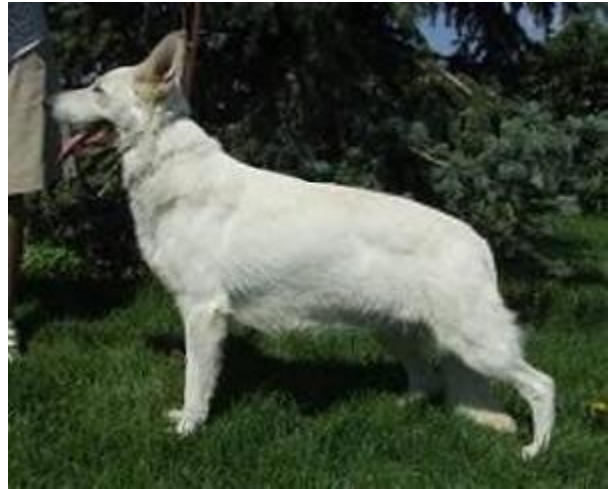
UKC/CH Regalwise Tetris Owner/Breeder: Ronda Beaupre Regalwise Shepherds