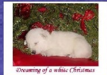
Dreaming of a white Christmas Entry # 3 C Litter Puppy 20 days Owners: Arleen Ravanelli Shylo Star Kennels