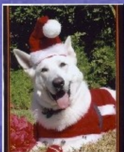
Entry # 7 Trooper 6 yrs. Owners: Scottie & Beth Crawford - Naples, FL.