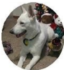
Gift of Grace Kennels http://giftofgracekennels.com

The rest is just patience and persistence. Start out with bringing the puppy to his toy box. Make sure it is always in the main room the dog is in and easily assessable. Take each toy out one at a time and play with him with it. Praising him all the time. Then place the toy in the toy box and take out the next one as he watches. Keep doing this till you have introduced him to all his toys. This is teaching him where his toys are and that these toys are allowed to be played with. The scent marker on the toys is to help him to discern his toys from everything else. After this every time you find him with a toy that is not his clap your hands loudly to distract him from the toy, take it from him and very firmly say “(puppy’s name)Not Yours.” Then immediately take him to his toy box and introduce him to his toys. Play with him with one of his toys and praise. Follow this routine every single time he is caught with a toy that is not his. In a few months your puppy will know the difference between his toys and your children’s toys. Usually by the time they are 10 months to a year you can stop scenting the toys. But every time you introduce a new toy add the scent for a couple of weeks so the dog knows it is his to play with. Soon you will be able to trust you dog as much as you can see I trust mine.