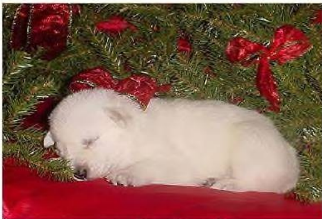
Dreaming of a white Christmas

Happy Holidays from Stylin' Silver Kennels