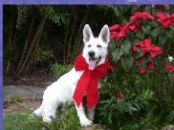
Entry # 8 Indy 5 mos. Owners: Scottie & Beth Crawford - Naples, FL.