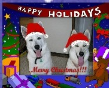
Entry # 4 Ruger 3 yrs. Zehra 4 yrs. Owners: Cathy Wasman Hidden Hill White