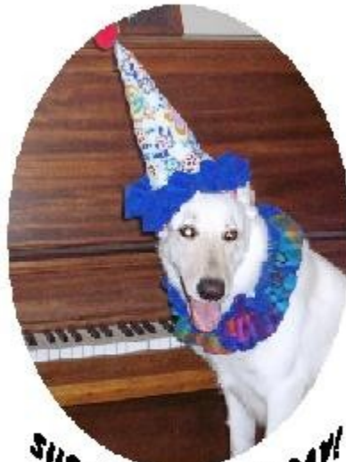
SUGAR'S 4TH BIRTHDAY! STARR SHEPHERDS DOB:12-21-02