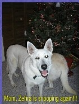
Entry # 5 Ruger 3 yrs. Zehra 4 yrs. Owners: Cathy Wasman Hidden Hill White