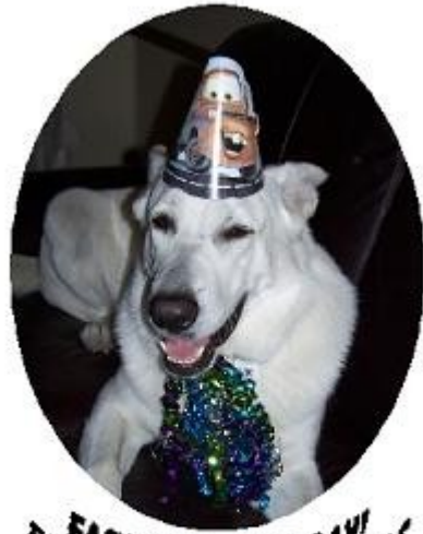
EASY'S 2ND BIRTHDAY! FOXHUNT WHITE SHEPHERDS DOB:11-09-04