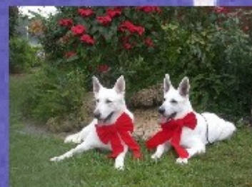
Entry # 6 Indy 5 mos. Trooper 6 yrs. Owners: Scottie & Beth Crawford - Naples, FL.