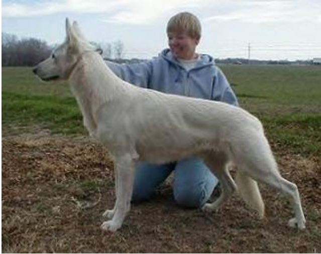
UKC/CH Regalwise Roy Rogers V Juel Owner/Breeder: Ronda Beaupre Regalwise Shepherds