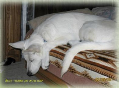
BUZZ - SLEEPING OFF IN HIS SLEEP