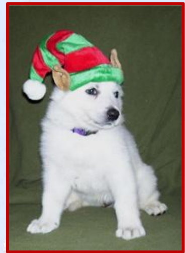
Entry #4: Arleen Ravanelli