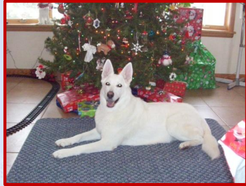
Entry #2: Arleen Ravanelli