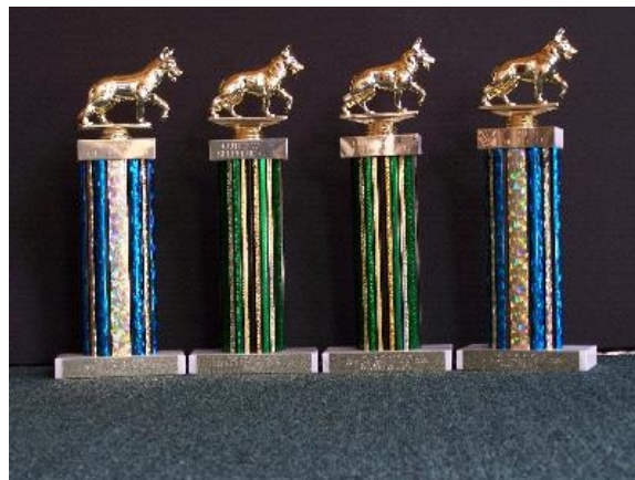
Trophies for the 1st Annual UWSC WS Howl-O-ween costume contest