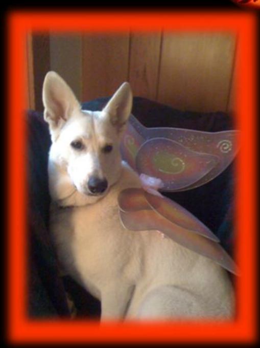
Entry #2: Zoie McDonald