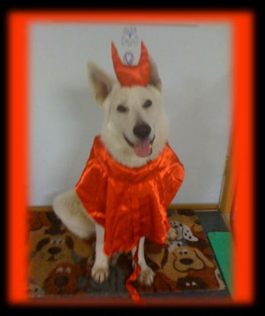
Entry #4. Zoie McDonald