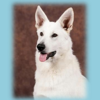
Canine Good Citizen Versatile Canine Companion Herding Dustinct Ducks Versatile Companion Excellent Outstanding Versatility